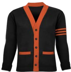
Left Sleeve Stripes