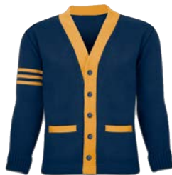
Right Sleeve Stripes

To SEE your sweater design, use the Apparel Builder!