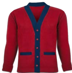
No Sleeve Stripes